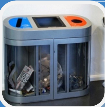
Torpedo Transparent Height: 910mm Width: 1000mm Depth: 430mm Capacity: 162 Litres Weight: 60 kg