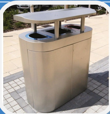
Torpedo Triple with Orbit Hood Height: 1245mm Width: 1100mm Depth: 633mm Capacity: 270 Litres Weight: 80 kg