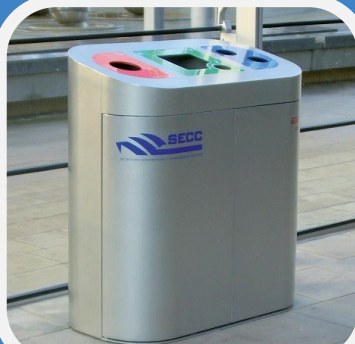
Torpedo Triple XL Height: 1065mm Width: 1000mm Depth: 533mm Capacity: 270 Litres Weight: 70 kg