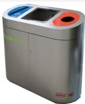
Torpedo Triple Height: 910mm Width: 1000mm Depth: 430mm Capacity: 162 Litres Weight: 60 kg

The Torpedo Triple range consists of four versions